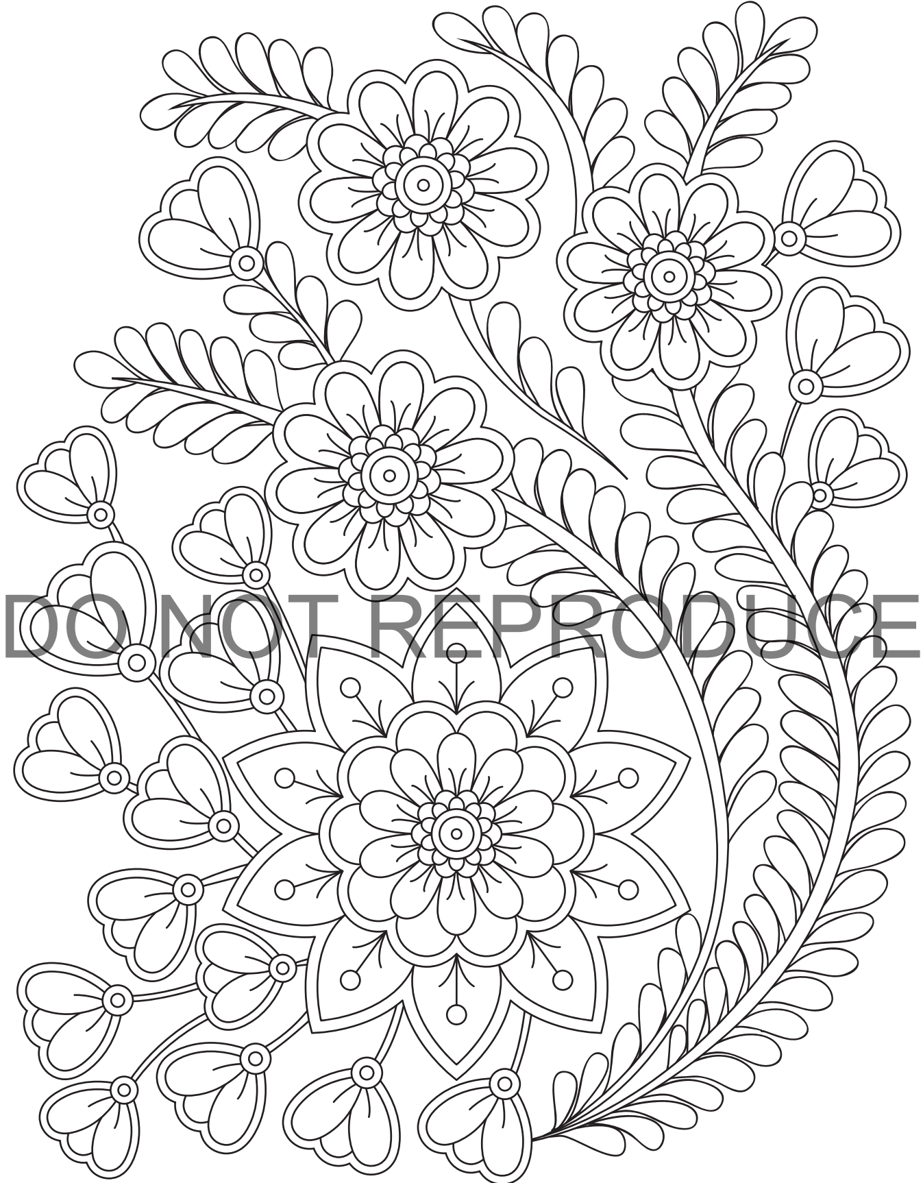
Herald of Spring