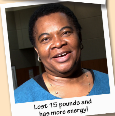
Lost 15 pounds and has more energy!