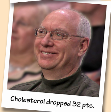
Cholesterol dropped 32 pts.