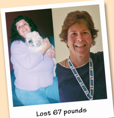
Lost 67 pounds