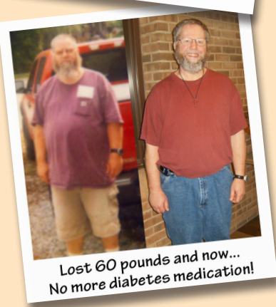
Lost 60 pounds and now... No more diabetes medication!